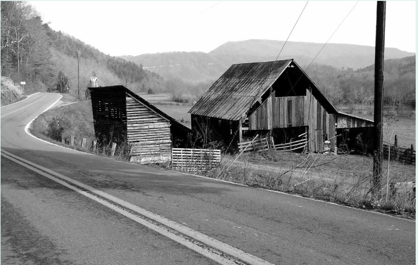
A portion of the Webb Brothers Century Farm, founded in 1880 and situated along the scenic Hiwassee River in Polk County, will be protected forever as part of a conservation easement held by the Land Trust for Tennessee. A photo of the farm was included on page 132 of Barns of Tennessee (see page 2).

If you or someone you know is considering taking permanent action to ensure that your land stays open and green for your children and grandchildren, talk to your tax advisor and/or contact the Land Trust for Tennessee. The Trust's staff predicts that the expiring tax incentives will make 2009 another record year for protecting farm land, and they would like to start the process with potential landowners earlier rather than later in the year. Doing so will ensure plenty of time to work together through the specific decisions you must make about your land's future uses. If you or anyone you know is considering a conservation agreement regarding land, now is the time to call the Land Trust for Tennessee and set up an initial site visit. To receive additional information about these enhanced tax incentives, please contact the office at (615) 244-5263 or visit the Web site, www.landtrusttn.org . Staff members will gladly answer your questions about the process of conserving your land. You may also visit www.landtrustalliance.org/policy/taxincentives/tax-policy .