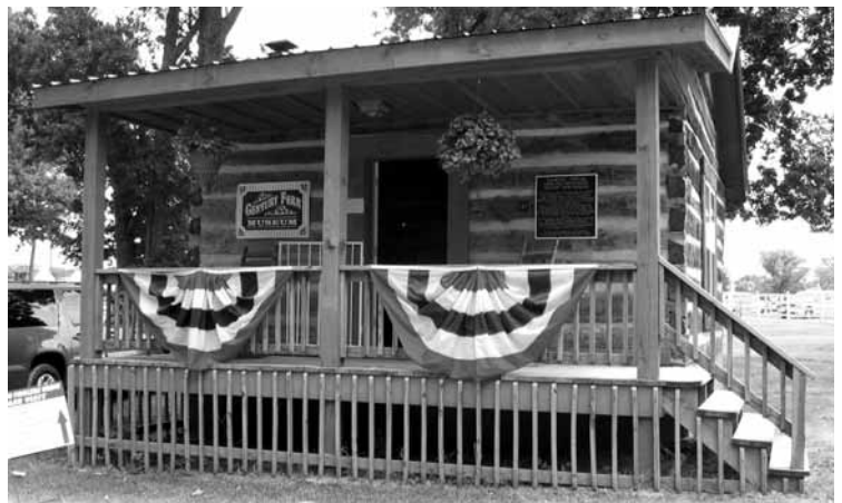
The Wilson County Fair will host its 16th Century Farm luncheon on August 27. Also, a Century Farm will be featured each night of the fair, and owners will display some of their farm and family objects and memorabilia in the Century Farm Museum in Fiddlers' Grove.