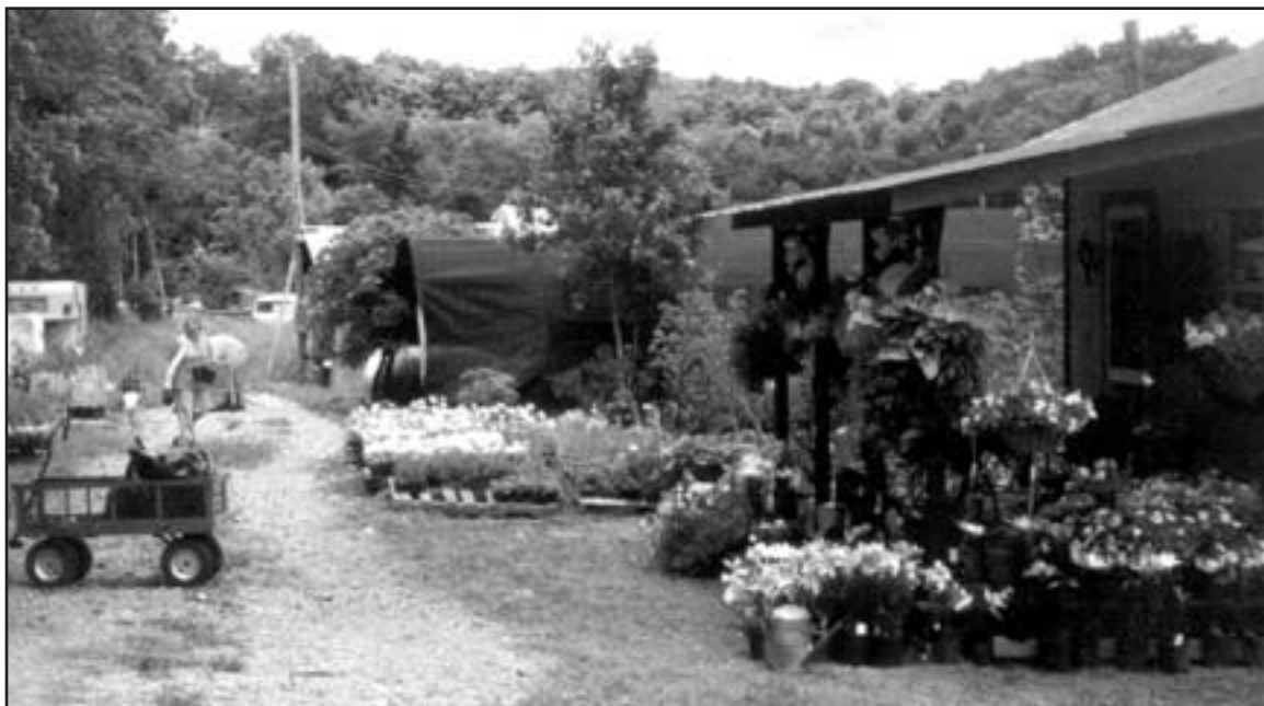
Campbell Century Farm in Maury County