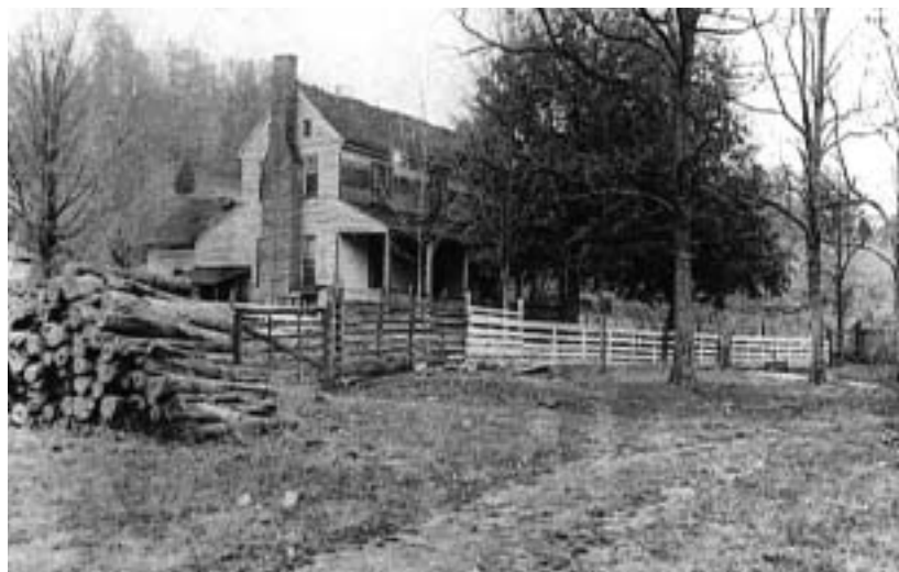
The Orr homestead, as it appeared in 1911. Located in Marshall County, Orr's Green Valley Farm was founded in 1817.

This Tennessee Century Farms newsletter is produced as a public service by the Center for Historic Preservation at MTSU.