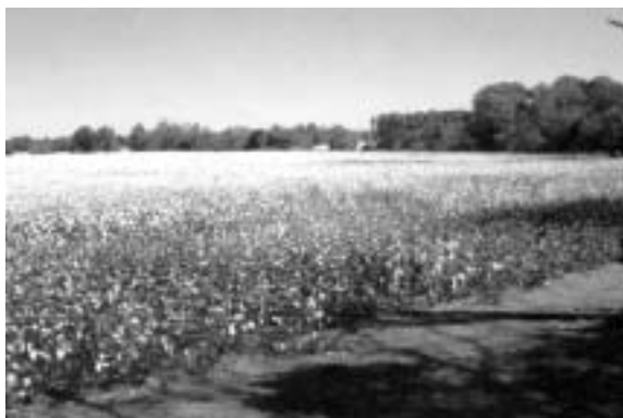
Cotton is a traditional crop on the Chance Farm (founded 1903) in Carroll County.