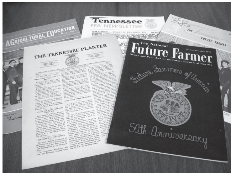
The FFA archival collection has many pamphlets and flyers that detail the history of the organization.